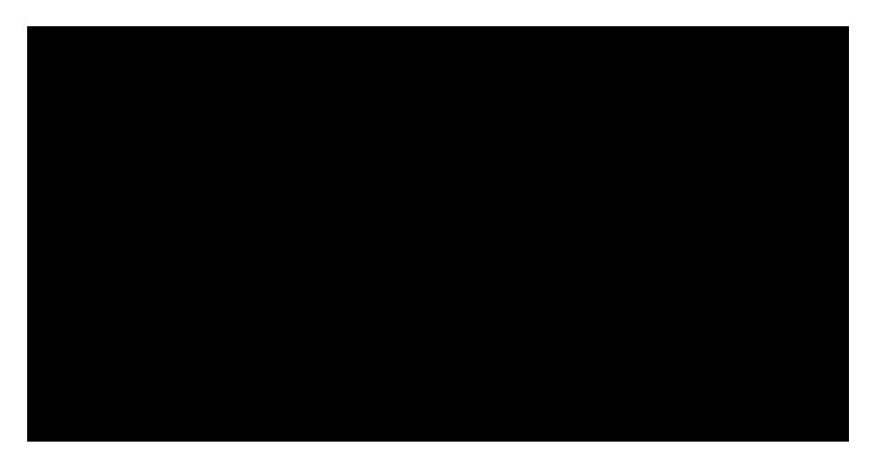
Figure-1: Contribution of Agricultural Sub-Sectors to GDP (% Shares)

It is estimated that 30-35 million people are engaged in livestock related activities and generate 30-40% of their income from livestock enterprises. This supplemental income is very significant in view of the tendency of the declining size of ownership holdings in agriculture and the growing number of the landless in the rural economy. Livestock enterprises are particularly important for the landless and small farmers because livestock provides an alternative form of asset ownership, independent of land. For these poorer segments of the rural population, livestock ownership acts as insurance in the event of crop failure and provides a repository of household saving that can be liquidated in case of emergencies. Finally, for subsistence farmers, livestock products in the form of fresh milk and butter or desi ghee provide food security for the family and help meet nutritional requirements in terms of calories and protein.